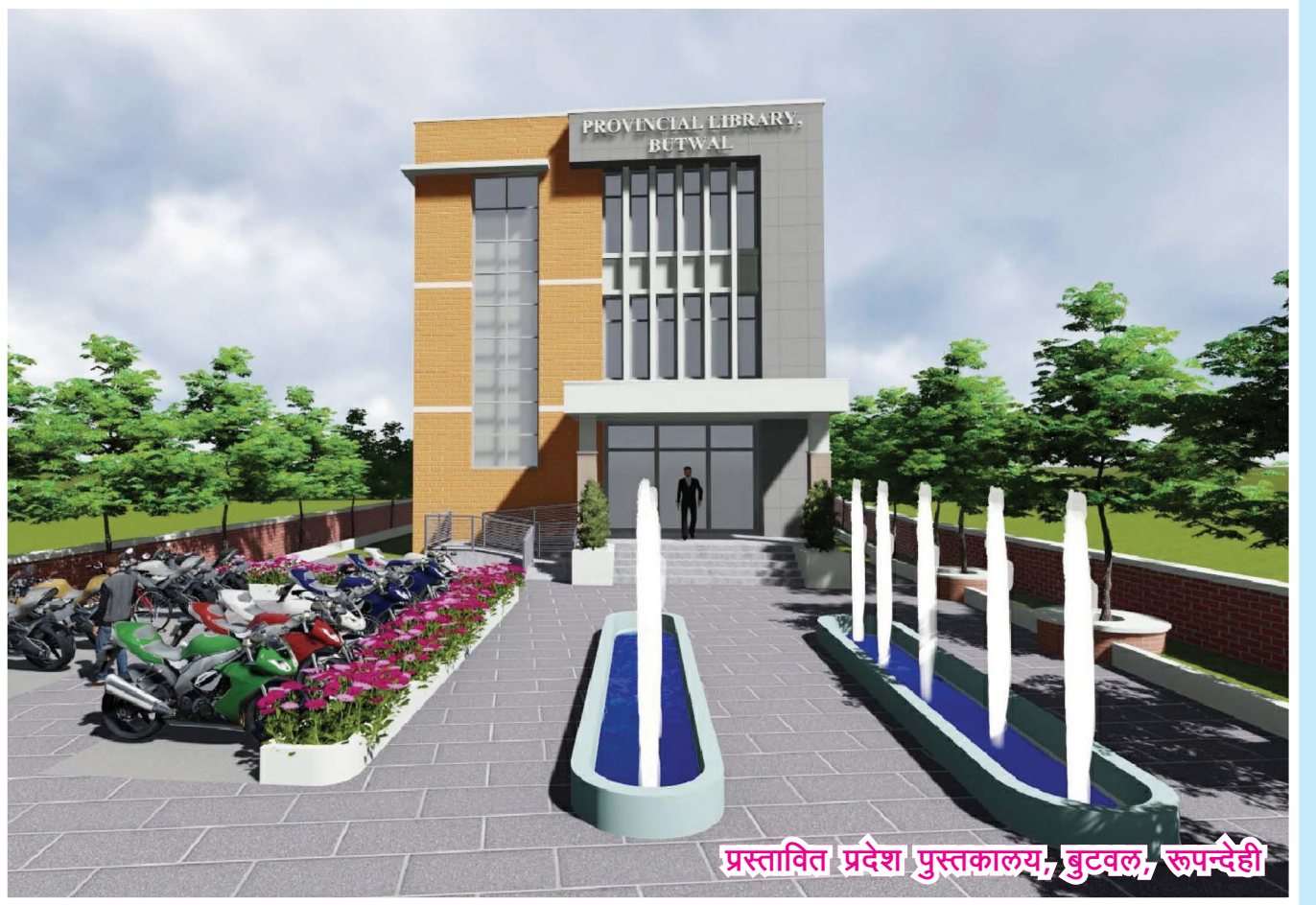
प्रस्तावित प्रदेश पुस्तकालय, बुटवल, रूपन्देही