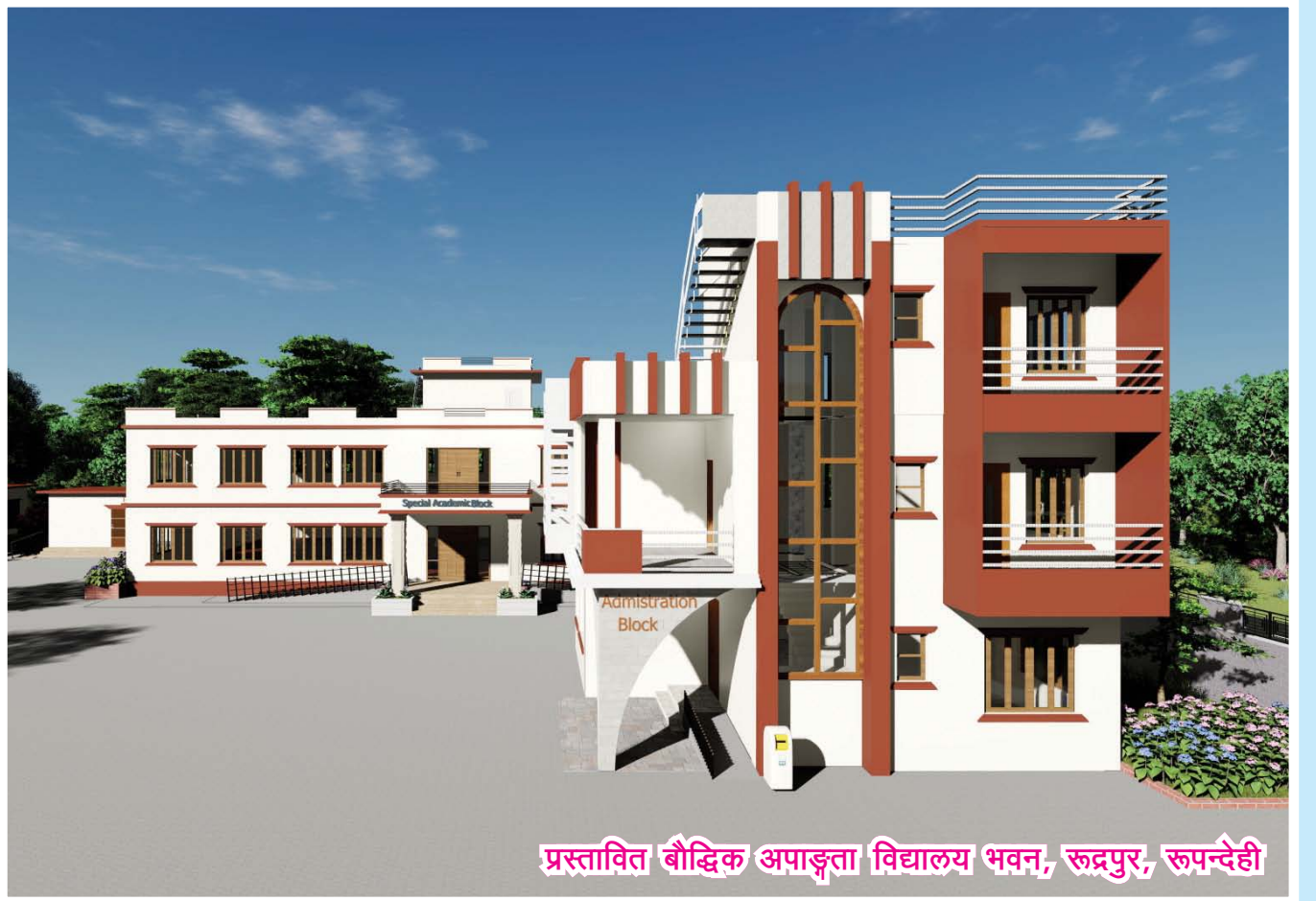
प्रस्तावित बौद्धिक अपाङ्गता विद्यालय भवन, रुद्रपुर, रूपन्देही